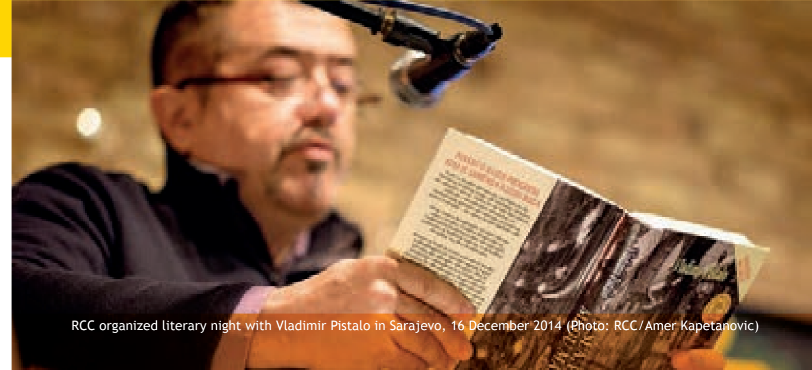
RCC organized literary night with Vladimir Pistalo in Sarajevo, 16 December 2014

Dynamic actions were carried out in relation to the monitoring and assessment of the SEE2020 Strategy, particularly regarding data collection for both qualitative and quantitative indicators. Possible joint activities with UNESCO will be implemented to mutually complement the existing policy tools and organise a joint training for the beneficiaries. Coordination with the international NGOs was intensified in developing joint projects such as the one on summer school for innovative on-site learning with EUROCLIO or further development of site management plans with Cultural Heritage without Borders.