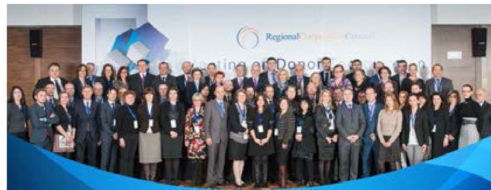
Meeting on Donor Coordination in the Western Balkans Sarajevo, 12-13 February 2015

In addition to these horizontal activities, RCC conducted a number of direct interventions to help implement the SEE 2020. The summary of these interventions structured in the five pillars of SEE 2020 Strategy is provided below.