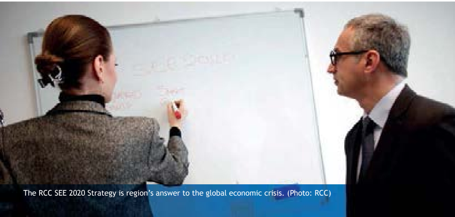
The RCC SEE 2020 Strategy is region's answer to the global economic crisis.

The Annual Report 2014-2015 unveils the progress made by the RCC in pursuing its mandate. It articulates the outcomes of the synergy with the SEECP and the dialogue with the RCC participants, while underlining their impact on the capacities of the RCC Secretariat to respond to the fast-paced and demanding regional environment in South East Europe. The report presents the results attained in the implementation of the first phase (2014) of the RCC Strategy and Work Programme (SWP) for 2014-2016, with an overt emphasis on the South East Europe (SEE) 2020 Strategy entitled: Jobs and Prosperity in a European Perspective.