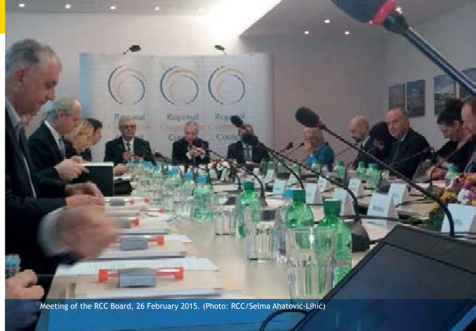
Meeting of the RCC Board, 26 February 2015.

Further, a forward-looking dialogue has been established with Bulgaria in the context of its forthcoming SEECIP CiO for 2015-2016. In preparation for a result-oriented synergy, the RCC Secretariat and Bulgaria have embarked on a process to synchronise their work plans and particularly to identify areas of joint action. Furthermore, it is notable that, in 2016, the incoming Bulgarian SEECIP CiO will mark the 20th anniversary of the SEECIP. This will represent an opportunity to review the track-record of SEE region and generate the kind of comprehensive political support that