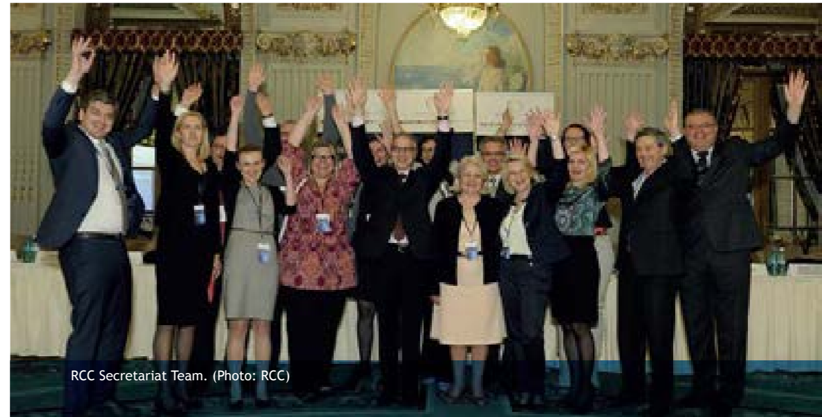
RCC Secretariat Team.

on key reforms and on underlying issues hampering their implementation.