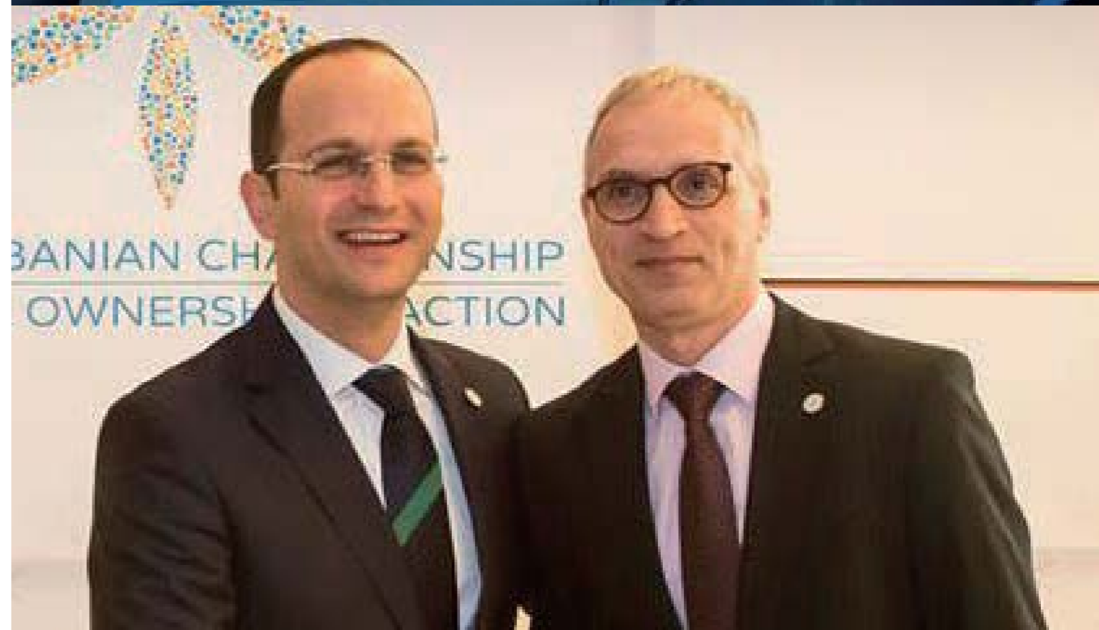
RCC Secretary General, Goran Svilanovic (right), with Minister of Foreign Affairs of Albania, Ditmir Bushati, in Tirana on 24 February 2015.