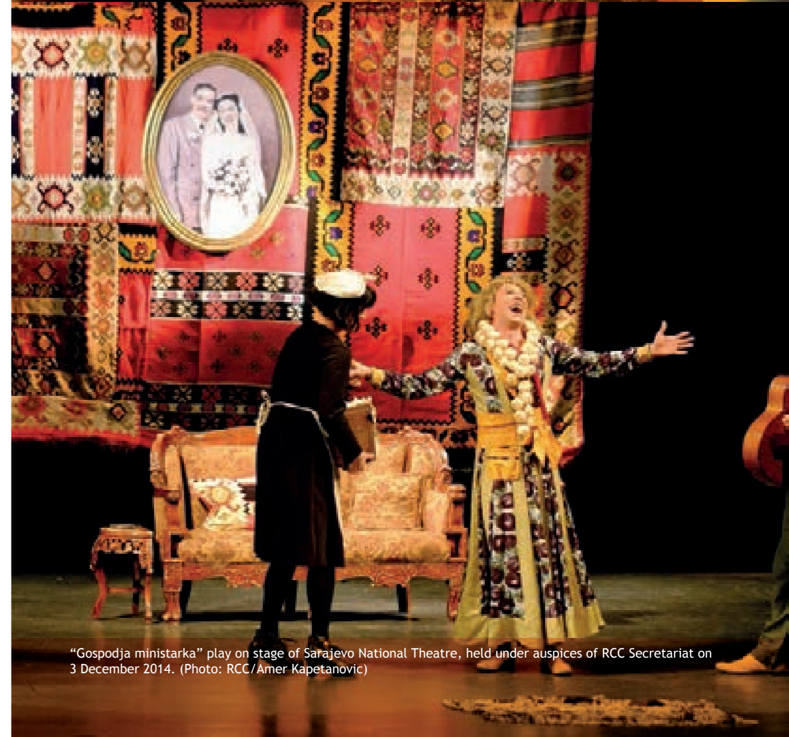
"Gospodja ministarka" play on stage of Sarajevo National Theatre, held under auspices of RCC Secretariat on 3 December 2014.